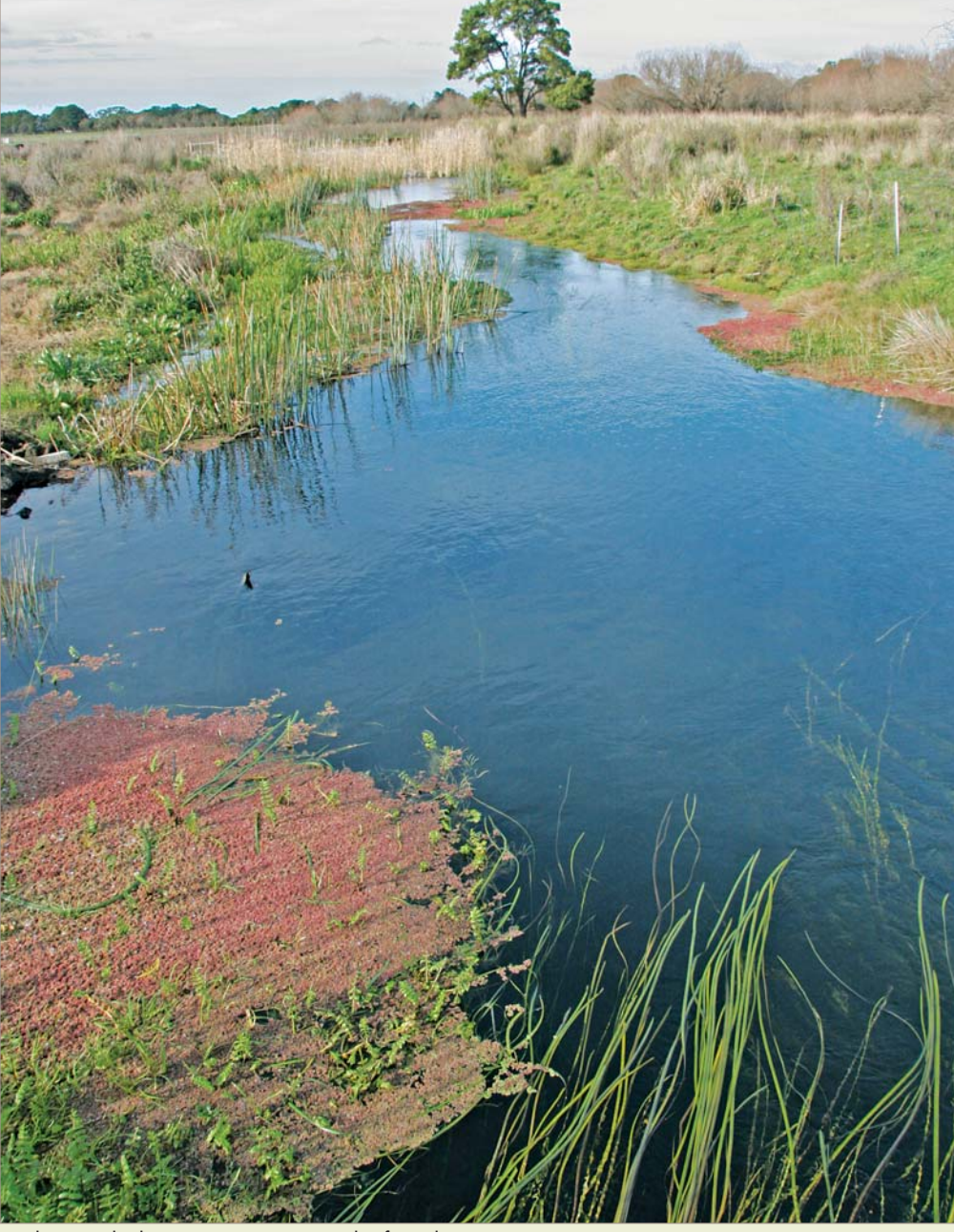
Darlots Creek, the main migration corridor for eels.

This supports the Gunditjmara claim that the separate but contiguous sections of the aquaculture system within this landscape, including the eel traps, were privately owned by different family groups. Nineteenth century writings also suggest that various types and styles of Indigenous housing were constructed prior to the arrival of Europeans, although the use of 'villages' as a settlement form seems to have disappeared soon after first contact. The dwelling remains that are found on the Stones today are c-shaped or u-shaped structures built