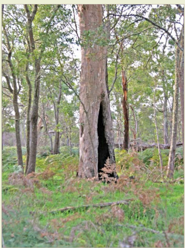
Hollow trees were used as smoking chambers to preserve the harvested eels for storage or trade.

Jimmy was told by his grandfather Jacko that his (Jacko's) grandfather's house was large as it needed to accommodate various gifts of food and other items that people of the various clans, and his own clan, would make when they wished to speak to him about certain matters. They waited in the special area outside until they had permission to approach. The house was strategically located with a clear view all around, including of the houses of other clan members and across the surrounding area for anyone approaching. It also looked directly across to Budj Bim. Around the house were the dwellings of single warriors who kept watch over their Chief and who dealt with anyone wanting an audience with him.